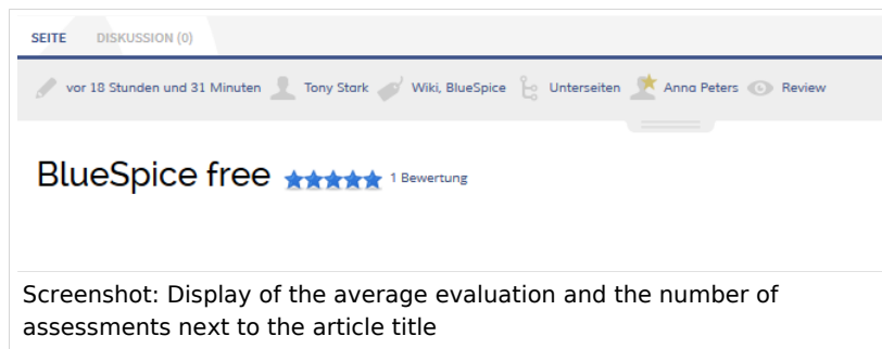
Screenshot: Display of the average evaluation and the number of assessments next to the article title

The feature is placed right at the article. There are two possibilities where it can be placed: next to the article title or in the StateBar .