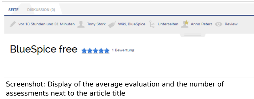
Screenshot: Display of the average evaluation and the number of assessments next to the article title

The feature is placed right at the article. There are two possibilities where it can be placed: next to the article title or in the StateBar .