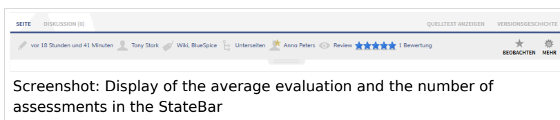
Screenshot: Display of the average evaluation and the number of assessments in the StateBar