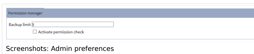
Screenshots: Admin preferences

Have a look at the admin preferences to define the PermissionManager.