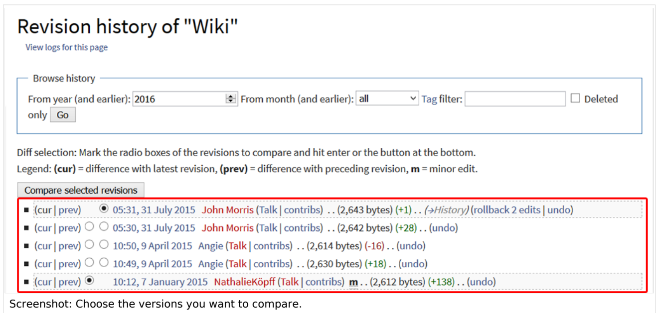
Screenshot: Choose the versions you want to compare.

Step 2: Choose the two versions of the article you want to compare.