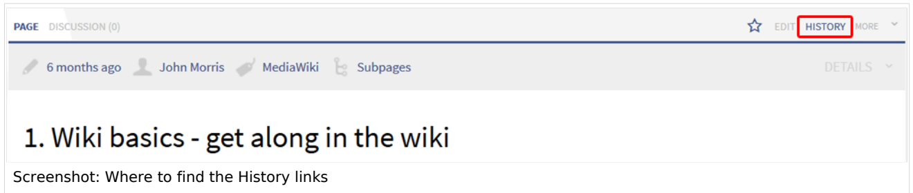
Screenshot: Where to find the History links

Step 1: Open the version history of the article by clicking on the "History" link in the upper right corner.