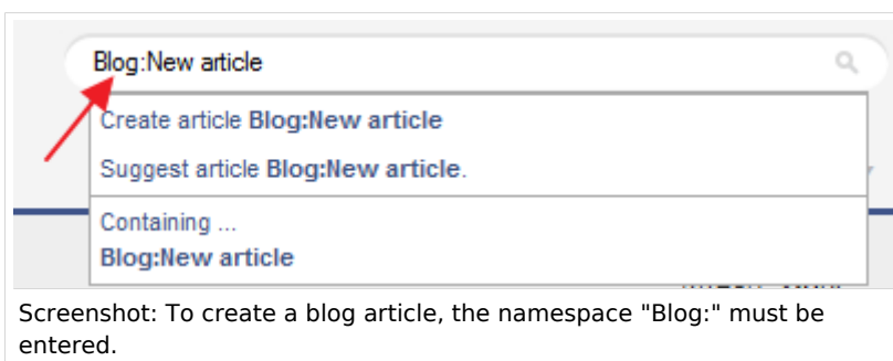
Screenshot: To create a blog article, the namespace "Blog:" must be entered.

Would you like to change the entry? Then click on the title of your blog entry. This takes you to the blog's wiki page where you can edit the wiki site as normal using the tab "Edit".