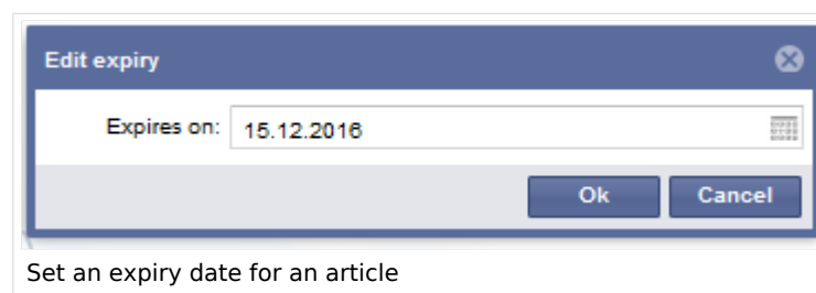
Set an expiry date for an article