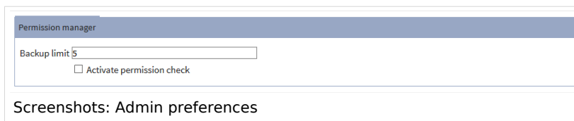
Screenshots: Admin preferences

Have a look at the admin preferences to define the PermissionManager.