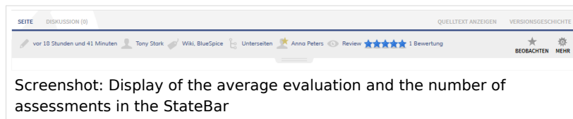
Screenshot: Display of the average evaluation and the number of assessments in the StateBar