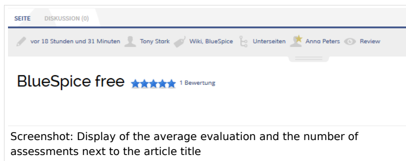
Screenshot: Display of the average evaluation and the number of assessments next to the article title

The feature is placed right at the article. There are two possibilities where it can be placed: next to the article title or in the StateBar .