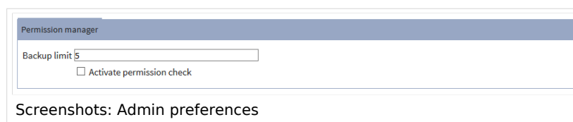
Screenshots: Admin preferences

Have a look at the admin preferences to define the PermissionManager.